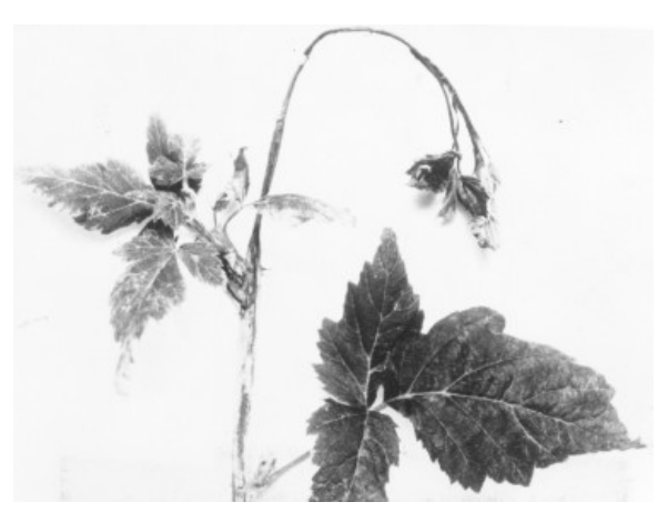
Figure 4. Young black raspberry cane affected with heat-labile component of raspberry mosaic.

Symptoms on Black and Purple Raspberries. The tips of young, black and purple raspberry canes, newly infected with mosaic, often curl downward, turn black (necrotic), and die (Figure 4). The fruit tends to be small, dry, and seedy. Leaves produced in hot weather are often nearly symptomless. Those formed in cool weather are faintly to severely mottled and puckered. Chronically infected plants become severely dwarfed and rosetted, with brittle cane tips and usually die in two or three years.