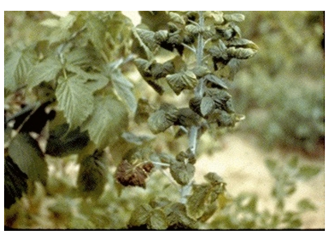
Figure 1. Leaf curl of red raspberry.

Positive identification of the virus or viruses responsible for the disease syndrome cannot be based entirely on foliage symptoms. Greenhouse and laboratory tests using specific indicator plants and serology are required. Positive identification is necessary to facilitate appropriate control measures and to help detect possible new virus diseases of brambles in Illinois.