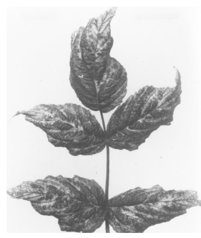
Figure 3. Mosaic symptoms on red raspberry in the late spring, green and yellowish-green mottling appear along with blisters on a leaf of a new cane.

The common raspberry mosaic complex is widespread and may cause the greatest reduction in growth, vigor, fruit yield, and quality of any of the bramble viruses. Fruit yield may be reduced 50 percent or more. No raspberries are immune, however, black and purple raspberries are damaged more severely than red varieties. The symptoms differ with the cultivar grown, the virus or viruses involved, geographical location, and seasonal growing conditions. Symptoms are most evident in the cooler weather of spring and fall, being masked (or disappearing) when temperatures are high in summer. Mosaic symptoms are sometimes confused with a late spring frost, powdery mildew, feeding by red spider mites and aphids, pesticide injury, or a soil deficiency of boron.