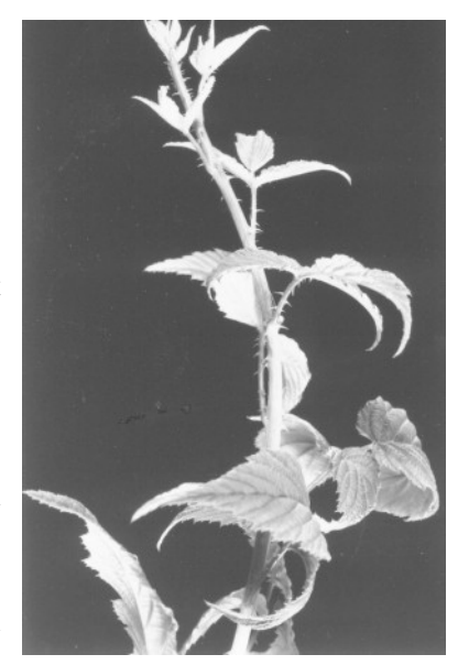
Figure 6. Black raspberry cane-'hooking' and recurving of leaves caused by streak virus.

How black raspberry streak spreads in nature is not known. Insect vectors whose identity is unknown may play an important role. The virus is not soilborne, and is not transmitted by the common raspberry aphids and other insects that frequently colonize brambles. There is good evidence that the virus does spread in the field. Healthy plants within 10 feet of an infected plant are three times more likely to become infected than are more distant plants. The number of visibly infected plants in a fruit planting may double each year because of the difficulty of detecting black raspberry streak, it is easily carried along with rooted tips in nursery propagation.