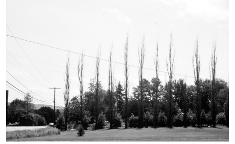
The deciduous Lombardy poplars in the foreground are most effective during the growing season when they are in leaf, but the evergreen trees in the background are an effective screen at any time of the year.

For seasonal screening, select deciduous trees. Deciduous screening trees will shade a window or door during the summer, but will allow more light in during the winter. Do not plant deciduous trees with litter problems – messy fruit or seedpods, flowers, large leaves, or weak branches (sweetgums, crabapples, silver maples, mulberries) - near sidewalks, patios, driveways, or other paved areas.