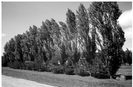
Narrow, upright Lombardy poplars are commonly used for wind screens.

A row or mass planting of trees, especially evergreens, helps to block wind, salt spray off of water or roads, and dust from open areas. When trees are planted in the long, narrow corridors between buildings, they can break up or reduce wind tunneling. A home with screening trees planted on the prevailing wind side can benefit from energy savings. Rows of evergreens planted along roadways can help keep roads clear of windblown snow, thereby reducing the expense of salting, sanding, or snowplowing.