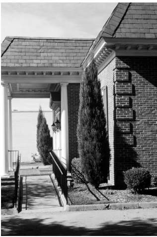
These narrow, upright junipers can be planted close to a building or fence for screening in a small area.

When selecting trees for screens, match the needed function to the mature shape of the tree. Choose trees with columnar or fastigiate forms (such as English oaks and European hornbeam) for narrow areas, row plantings, or against tall buildings. When planted in rows, trees with a narrow, columnar canopy effectively block an unsightly view, define areas, and act as a barrier. They can be planted close to fences and buildings without hanging over into other areas and can give a building a formal or classical appearance.