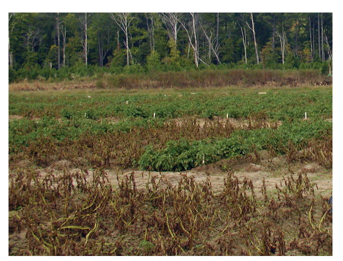
Figure 14. A commercial potato field in the Eastern Shore of Virginia that experienced progressive devastation from the late blight pathogen.