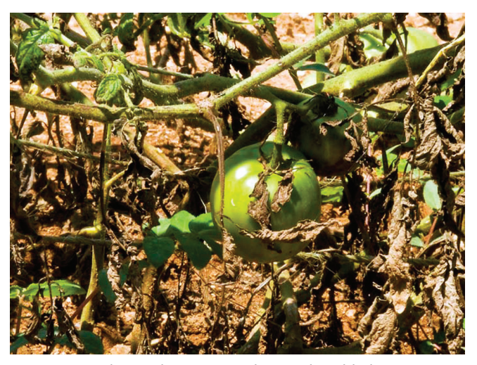
Figure 6. Under cool, moist conditions, late blight progressed rapidly through this tomato crop, leaving brown and withered foliage.