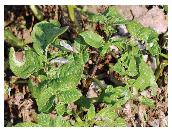
Figure 11. Blighted leaves, petiole, and stem lesions on potato.

If infected tubers are placed in cool, dry storage, disease progression slows or stops and lesions become dry. However, the disease is not eliminated, and P. infestans can resume growth and sporulation when environmental conditions become favorable again. Diseased tubers are prone to invasion by secondary decay organisms that can cause various tuber rots. As with tomato, when wet and cool conditions are prevalent, the disease typically progresses rapidly through the plant canopy and crop (figure 14).