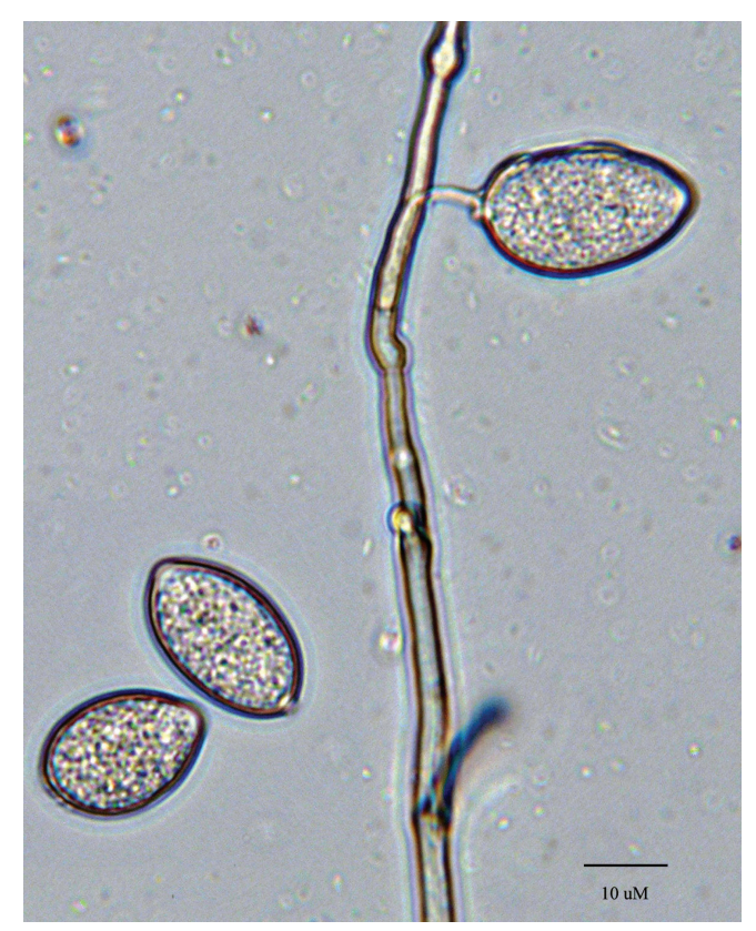
Figure 1. One lemon-shaped sporangium (zoospore-containing structure) of Phytophthora infestans on a sporangiophore and two sporangia that have been dislodged.