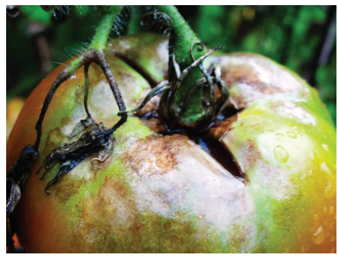
Figure 9. Often the stem end of fruit is first affected, because spores tend to land on the top of the fruit and small cracks favor infection by Phytophthora infestans.