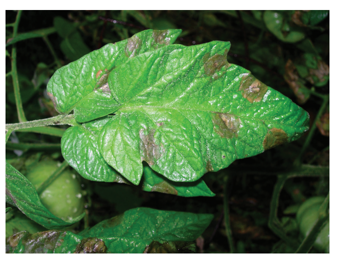
Figure 3. A tomato leaf with the first symptoms of late blight; these typically appear on the leaves as watersoaked, oily, pale or dark green or brown/black, circular or irregular lesions.

Late blight affects all aboveground parts of the tomato plant. The first symptoms usually appear on leaves as water-soaked, oily, pale or dark-green or brown/black, circular or irregular lesions (figure 3). Typically, younger, more succulent, tissue is affected first (figure 4). During periods of abundant moisture, sporulation of the pathogen can be seen by the naked eye as a white, cottony growth on the underside of affected leaves and/or on fruit lesions (figure 5).