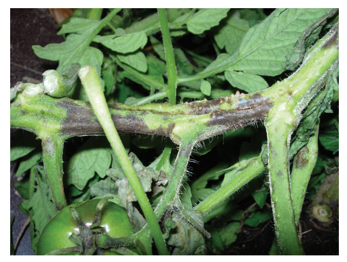
Figure 10. Dark, oily lesions of Phytophthora infestans on the stems of a tomato plant.