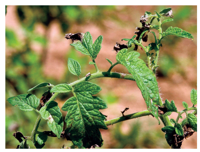
Figure 4. Young, succulent leaf tissue is typically first affected by the late blight pathogen.