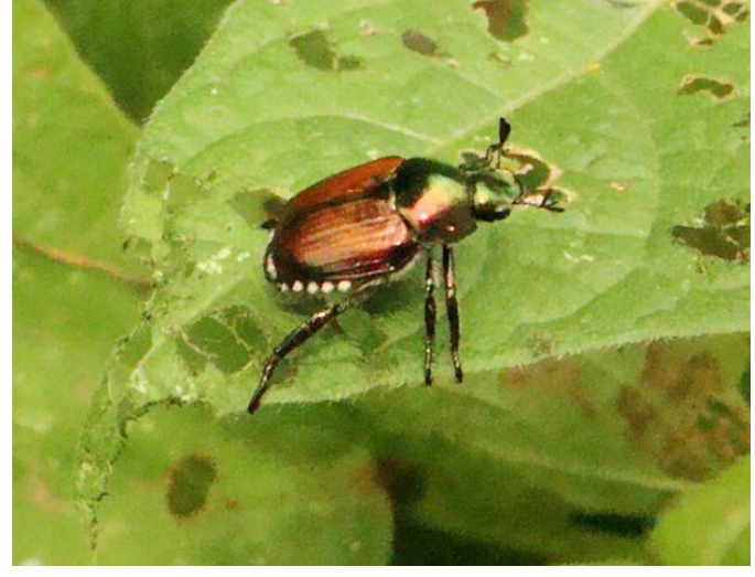
Japanese beetle adult. Photo by Eric Day, 2014

Description: The adult of the Japanese beetle is bright metallic green and is about 3/8 inch long. It is smaller then the Green June beetle which is over 3/4 inch long.