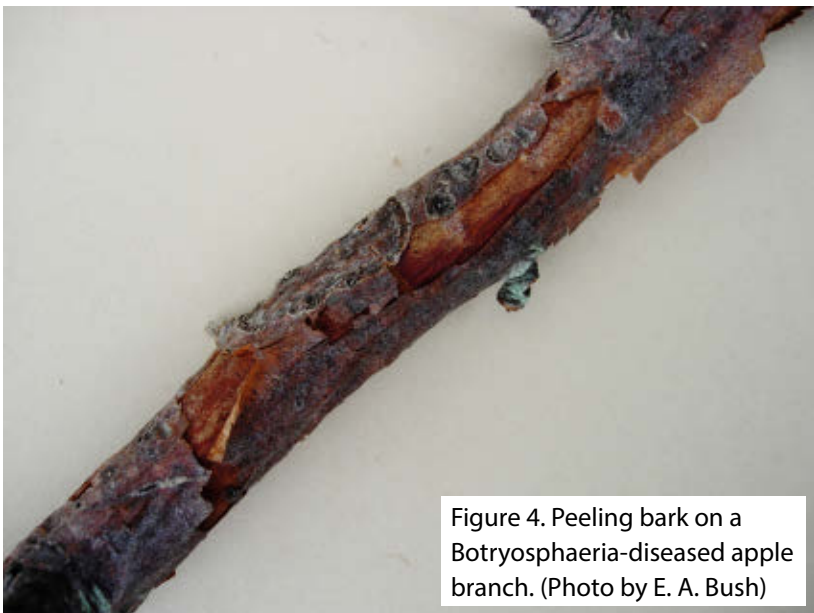
Figure 4. Peeling bark on a Botryosphaeria -diseased apple branch.

Cankered areas on tender stems of smooth-barked species, such as crab apple, may appear blistered (fig. 5). On gum-producing trees, such as sweetgum and Prunus species, gum may exude from cankered areas (fig. 6). Because of this symptom, Botryosphaeria canker and dieback on peach is called “gummosis.” Black fungal spore-producing structures (pycnidia) are sometimes present on diseased tissue and can be observed erupting through the bark. These fruiting bodies are white inside when sliced open (fig. 7).