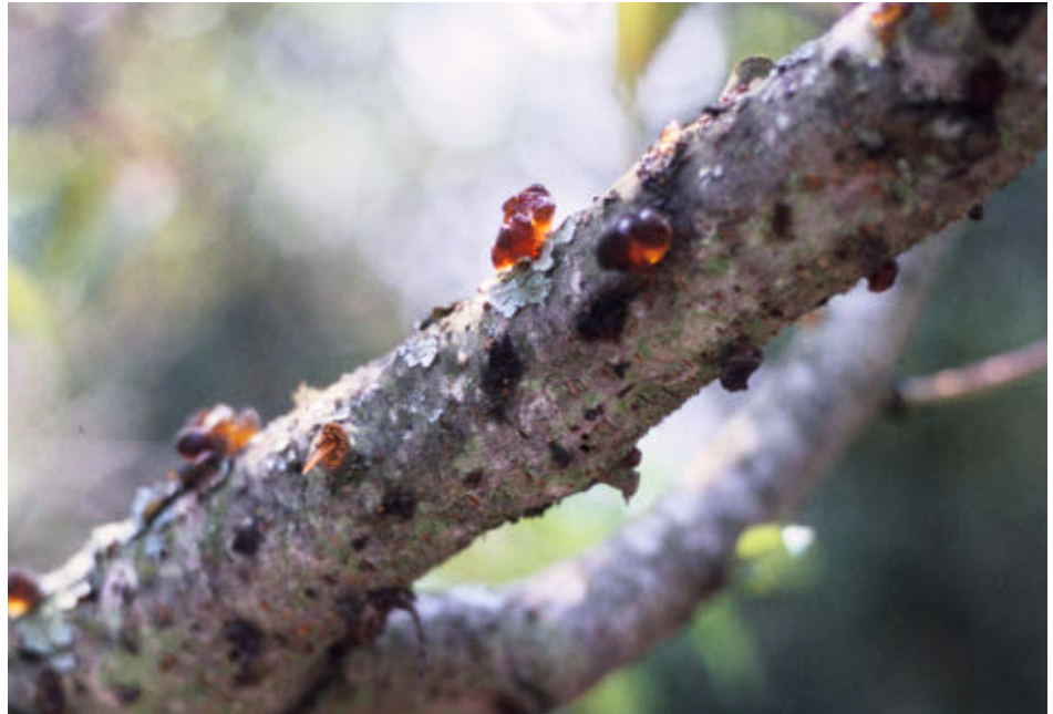
Figure 6. Gum exudation (gummosis) on a Botryosphaeria -diseased peach branch.