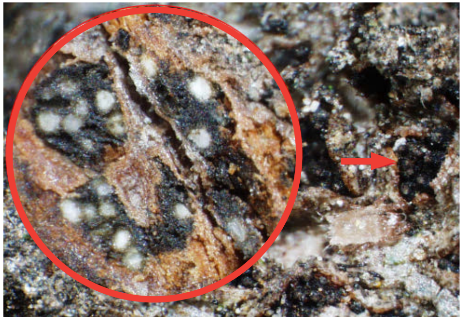
Figure 7. A magnified view of black fruiting bodies (pycnidia) [arrow] of Botryosphaeria species erupting through the bark of a Botryosphaeria -diseased photinia branch. The fruiting bodies are white inside when sliced open (circular inset).