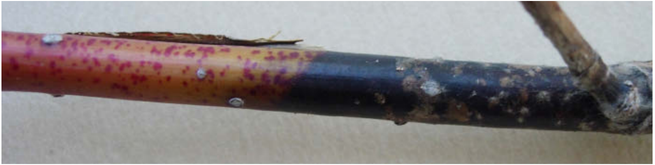
Figure 5. A Botryosphaeria canker (discolored tissue) on a smooth-barked bloodtwig dogwood.