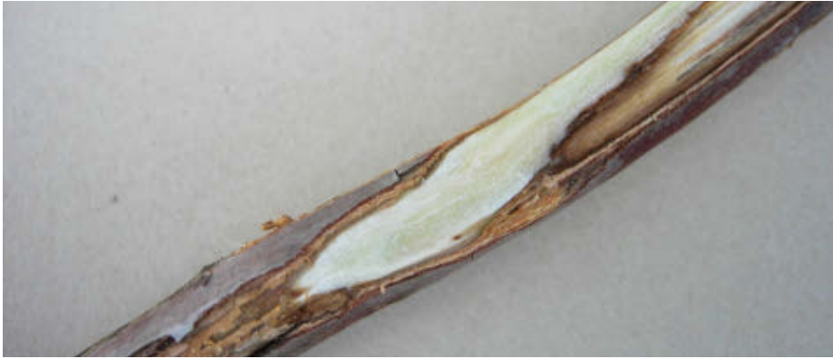
Figure 2. A wilting rhododendron branch with the bark partially removed to reveal the brown discoloration in the wood caused by Botryosphaeria species.