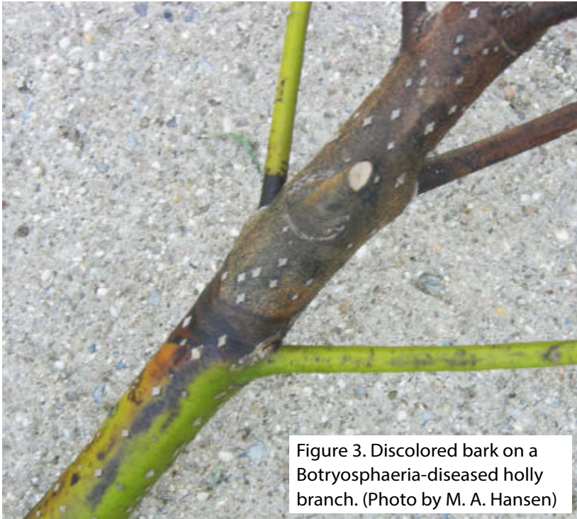
Figure 3. Discolored bark on a Botryosphaeria -diseased holly branch.

beneath the bark will be discolored brown to reddish-brown instead of white (fig. 2). In some cases, cankers may appear sunken and/or darkened (fig. 3) or be surrounded and contained by callused wound wood, particularly on larger branches or trunks. In other cases, bark may peel and drop from cankered areas (fig. 4).