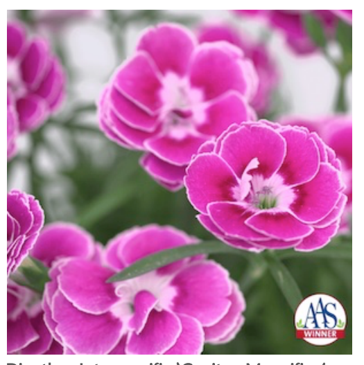
Dianthus Interspecific 'Capitan Magnifica' Judges were impressed with its continued blooming and growing even through summer's heat. Quick shearing after blooming gets it bouncing back with a profusion of beautiful pink blooms that are more heat tolerance than traditional dianthus varieties. Stems are also long

This new dahlia features striking deep black foliage and abundant ruby-red flowers. Semi-double to double blooms enhance its diversity on plants that are sturdy and do not flop open. It also remains disease free all season long.