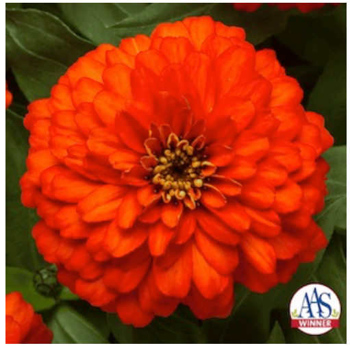
Zinnia 'Zydeco Fire'

Its fiery orange fully double flowers that are noticeably larger than the comparisons. Judges were impressed with its long-lasting blooms on sturdy stems, blooming all summer long up until the first frost, as well as its disease-resistant foliage.