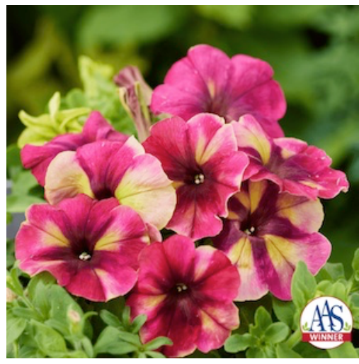
Petunia 'Shake Raspberry'

The bloom of this petunia has the coloration of a blended raspberry milkshake swirled with lemon-lime green sorbet. Naturally compact, this petunia will not melt in summer heat but instead will provide season long, delicious color.