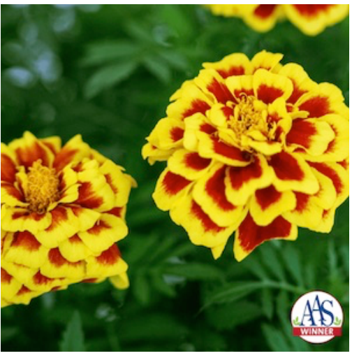
Marigold 'Mango Tango'

These cute, snack-sized mini peppers that are extra sweet with just the right amount of juiciness and crunch. They produce continuously on a moderate sized plant with outstanding bacterial resistance. A prolific number of bright, canary yellow-colored,