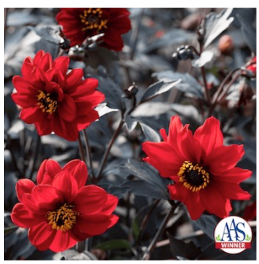
Dahlia 'Black Forest Ruby'

The selected winners represent the plants that demonstrate the best garden performance across North America as a result of growing in these trial and test gardens. Since the selections are made several times a year, the plants listed below represent the current winners as well as past selections that we have not yet featured.