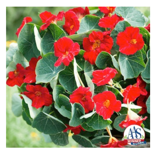
Nasturtium 'Baby Red'