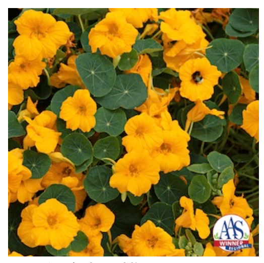
Nasturtium 'Baby Gold'

Its fiery orange fully double flowers that are noticeably larger than the comparisons. Judges were impressed with its long-lasting blooms on sturdy stems, blooming all summer long up until the first frost, as well as its disease-resistant foliage.