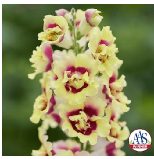
Snapdragon 'DoubleShot Yellow Red Heart' The snapdragon blooms early and holds up well through summer's heat better than the comparison varieties. Judges loved the early blooms, healthy plants, vibrant colors, and long-lasting flowers

The bloom of this petunia has the coloration of a blended raspberry milkshake swirled with lemon-lime green sorbet. Naturally compact, this petunia will not melt in summer heat but instead will provide season long, delicious color.