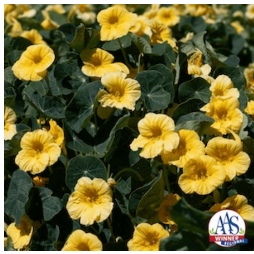
Nasturtium 'Baby Yellow'

This squash brings new psychedelic color patterns to your fall decor. Shallow vertical ridges alternate between a variegated cream and green with bright orange. Fruit colors shift and change as they mature for early to late season color.