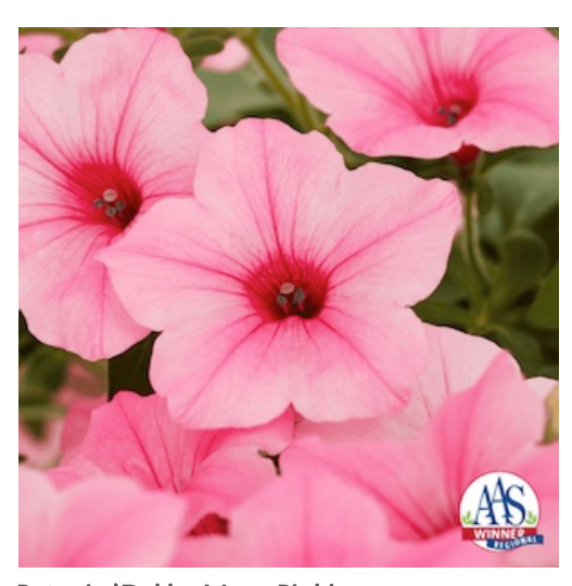
Petunia 'Dekko Maxx Pink'

This marigold sports a stunning, super-saturated bicolor flower of yellow and red. The compact, vigorous plants bloom prolifically over a long flowering window, maintaining its form and color through the summer.