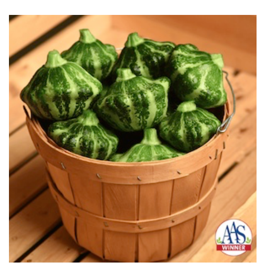
Squash 'Green Lightning'

This squash brings new psychedelic color patterns to your fall decor. Shallow vertical ridges alternate between a variegated cream and green with bright orange. Fruit colors shift and change as they mature for early to late season color.